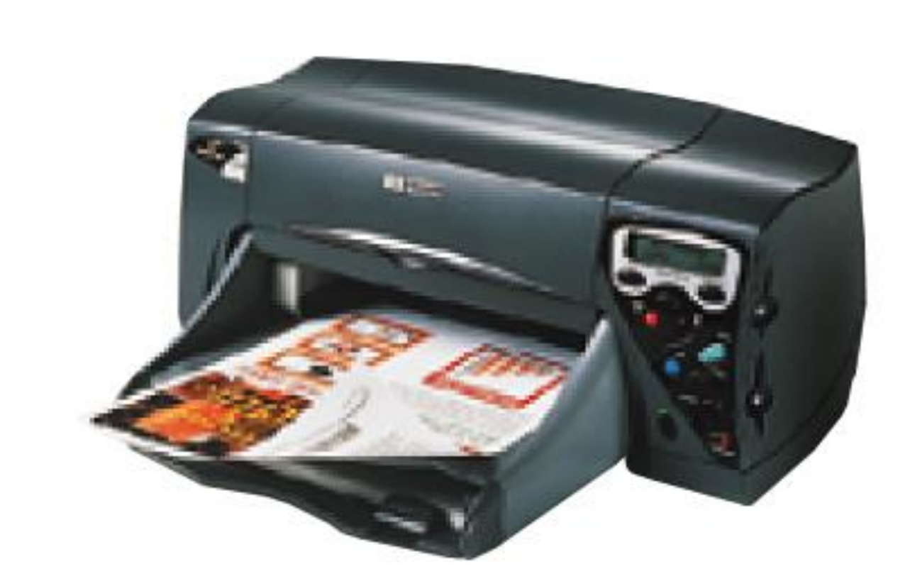
Figure 5. Peter Norton's Introduction to Computers 4th Edition

©2004 Texas Trade and Industrial Education