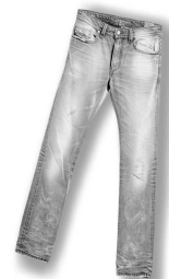
A pair of trousers

Once a young man went to town and bought a pair of trousers. When he got home, he went upstairs to his bedroom and put them on. He found that they were too long. He went downstairs, where his mother and two sisters were washing up in the kitchen. "These new trousers need shortening by five centimeters," he said. They were busy and none of them said anything. When his mother finished washing up, she made the trousers shorter by five centimeters and didn't say anything to her daughters. After supper the elder sister remembered her brother's request. She shortened the trousers by five centimeters and said nothing to anybody. The younger sister also went upstairs and took five centimeters off the legs of the new trousers. You can imagine the boy's face when he put the trousers on the next morning.