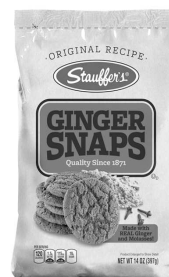
A pack of biscuits

One night there was a woman at the airport who had to wait for several hours before catching her next flight. While she waited, she bought a book and a pack of biscuits to spend the time. She looked for a place to sit and waited. She was deep into her book, when suddenly she realized that there was a young man sitting next to her who was stretching his hand, and taking biscuits lying between them. He started to eat them one by one. The woman ate the biscuits and watched the clock, while the young man was also finishing them. The woman started to get really angry. Every time she ate a biscuit, he had one too. She had never met anybody like him. She took her bags and went towards the boarding gate. After boarding the plane, she looked into her bag. She was surprised to find her pack of biscuits inside.